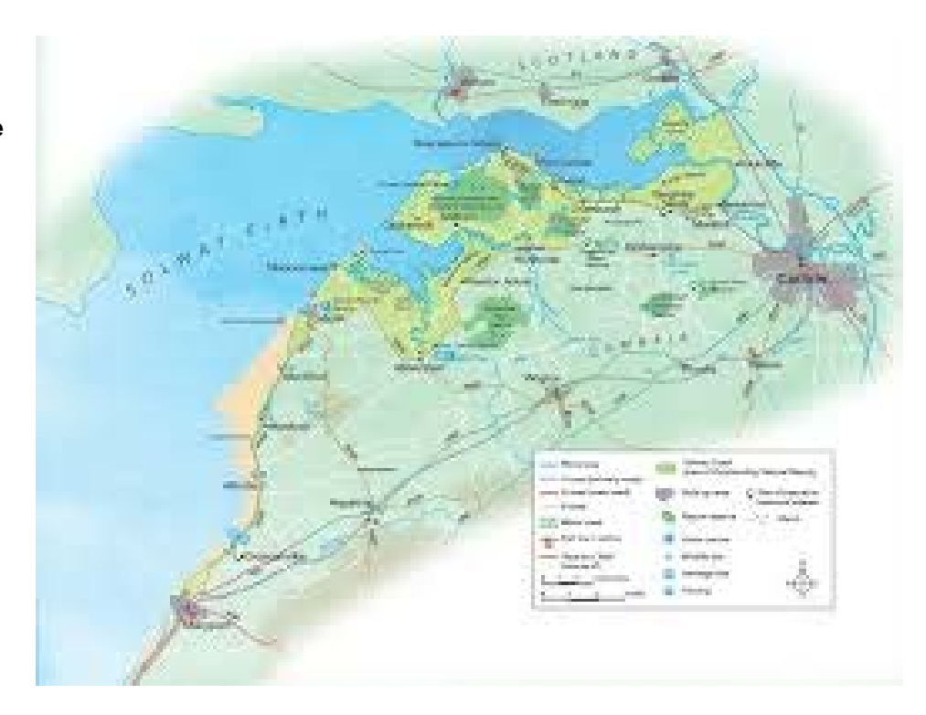
Figure 1: The area of coverage of the Solway Coast Area of Outstanding Natural Beauty Management Plan

As impacts from the Management Plan may occur beyond the administrative boundary of the AONB, provided there is a pathway between the source of impacts and a European/Ramsar Site, a 15km buffer has been applied to the outer boundary of the AONB area and the European/Ramsar Sites within that buffer are also considered. However, it should be noted that for certain impacts, longer range pathways may exist. These will be investigated on a case-by- a case basis. The European Sites within the AONB and a 15km buffer zone are: